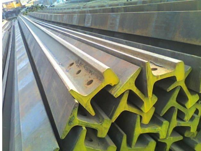
Fig 2: Material property test report of M-type light steel

It can be seen from the inspection report that the tensile strength of M-shaped light steel with a thickness of 1.2mm reaches 469 MPa, and the mechanical properties of finished Q235 steel plate number are 374MPa, which meets the industry standards. The measured yield strength is 328MPa, which is greater than the nominal yield strength of 235MPa. The ratio of measured tensile strength to measured yield strength is greater than 1.2, and the elongation of section steel is greater than 20%, which meets the requirements of Code for Seismic Design of Buildings GB/T50011-2010.