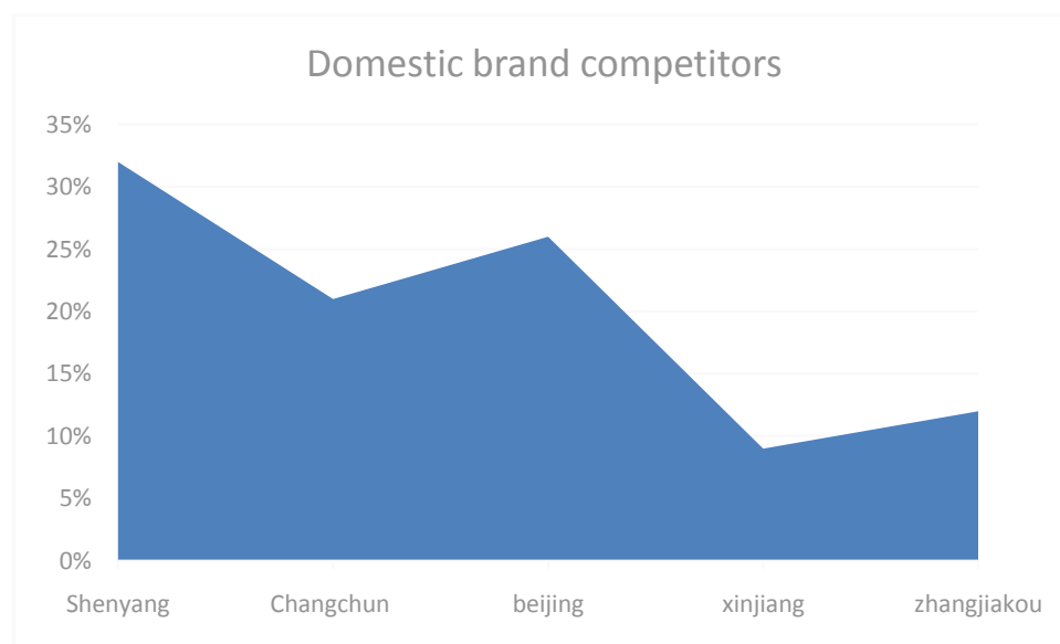
Figure 1: Domestic brand competitors

The author conducted an online survey on the popularity of ice-snow tourism cities, the respondents chose according to their preferences. It can be seen from Figure 1 and figure 2 that the domestic brand competitors of Arctic Village of Mohe County are mainly Shenyang and Changchun, while the foreign brand competitors are mainly Japan and South Korea. Competition among brands of ice and snow tourism can greatly promote the integration of ice and snow resources in Arctic Village of Mohe County and enhance the city's brand image from the perspective of marketing [8] .