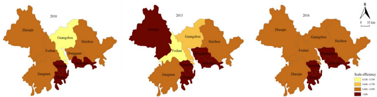
Fig. 3: Spatial-temporal evolution of scale tourism industry efficiency during 2010-2016

tourism factor input could just maximize the livelihood income of tourism, in the best scale stage. The returns to scale in Guangzhou always decreased, meaning that the input of tourism factors had exceeded the digestion ability of the city, and resource and factor input was redundant. The returns to scale in Foshan, Huizhou and Jiangmen increased at the beginning but decreased in the middle to late stage, suggesting that tourism factor input was redundant, and these cities shall narrow the scale of tourism input, and focus on improving the development quality of tourism industry.